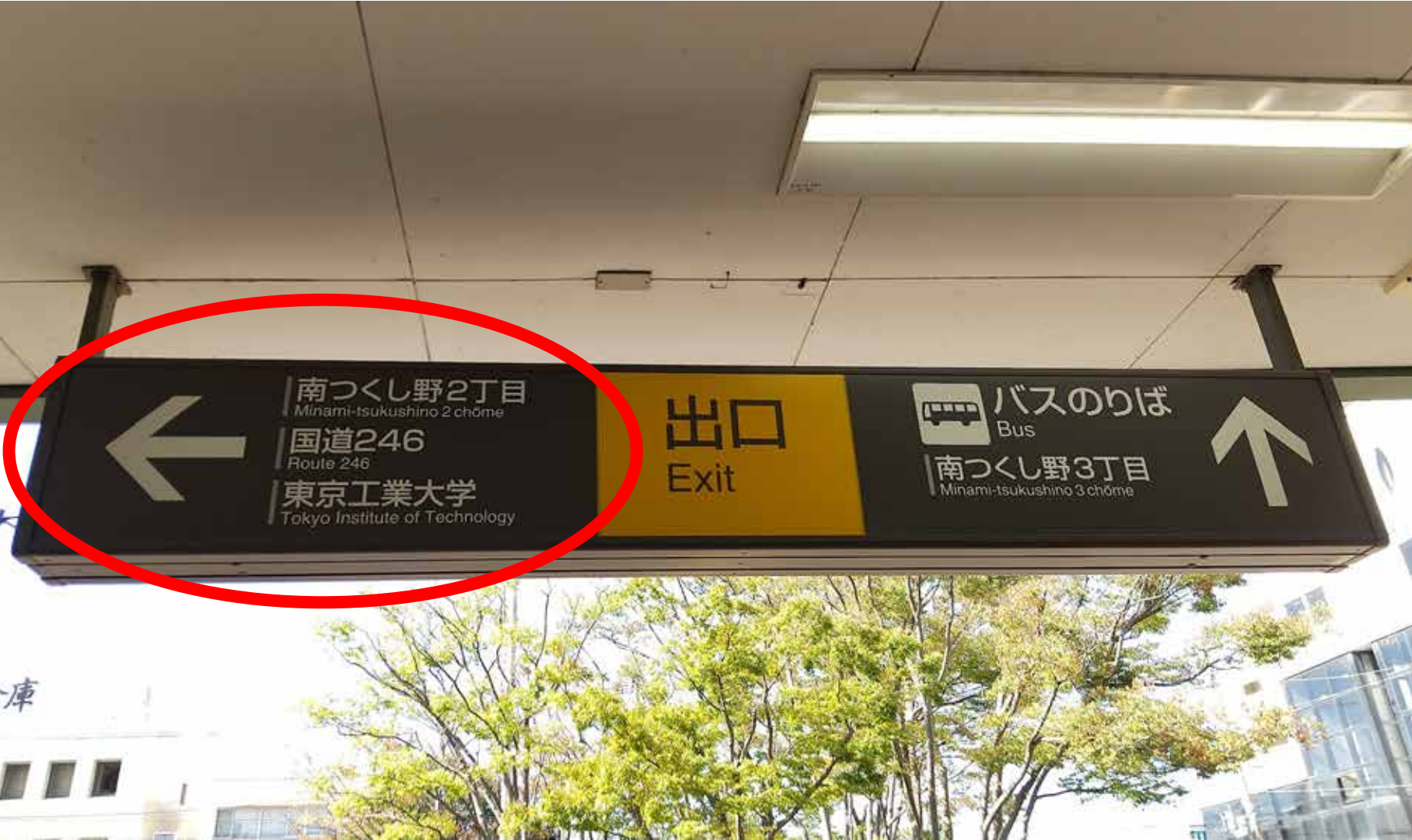
Follow the sign. It takes 5-10 minutes walk.