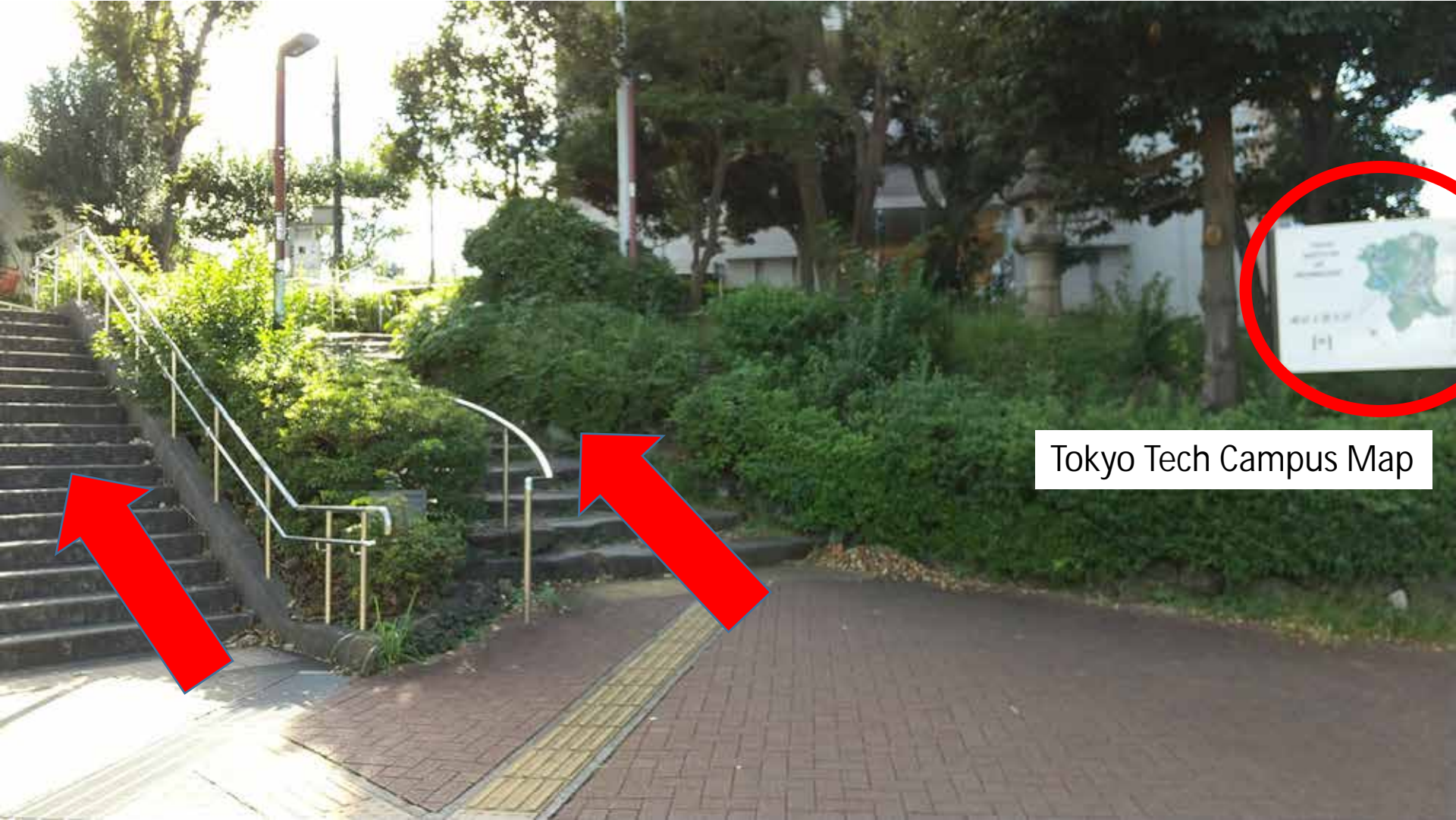
Tokyo Tech Campus Map

Go upstairs. There are two staircases, either of which can be taken.