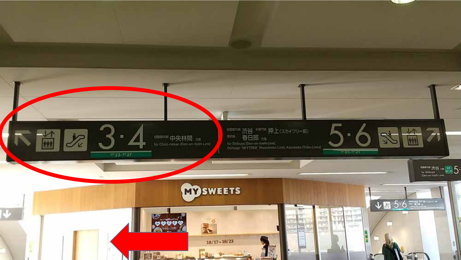
Go to the left for Chuo-rinkan direction.