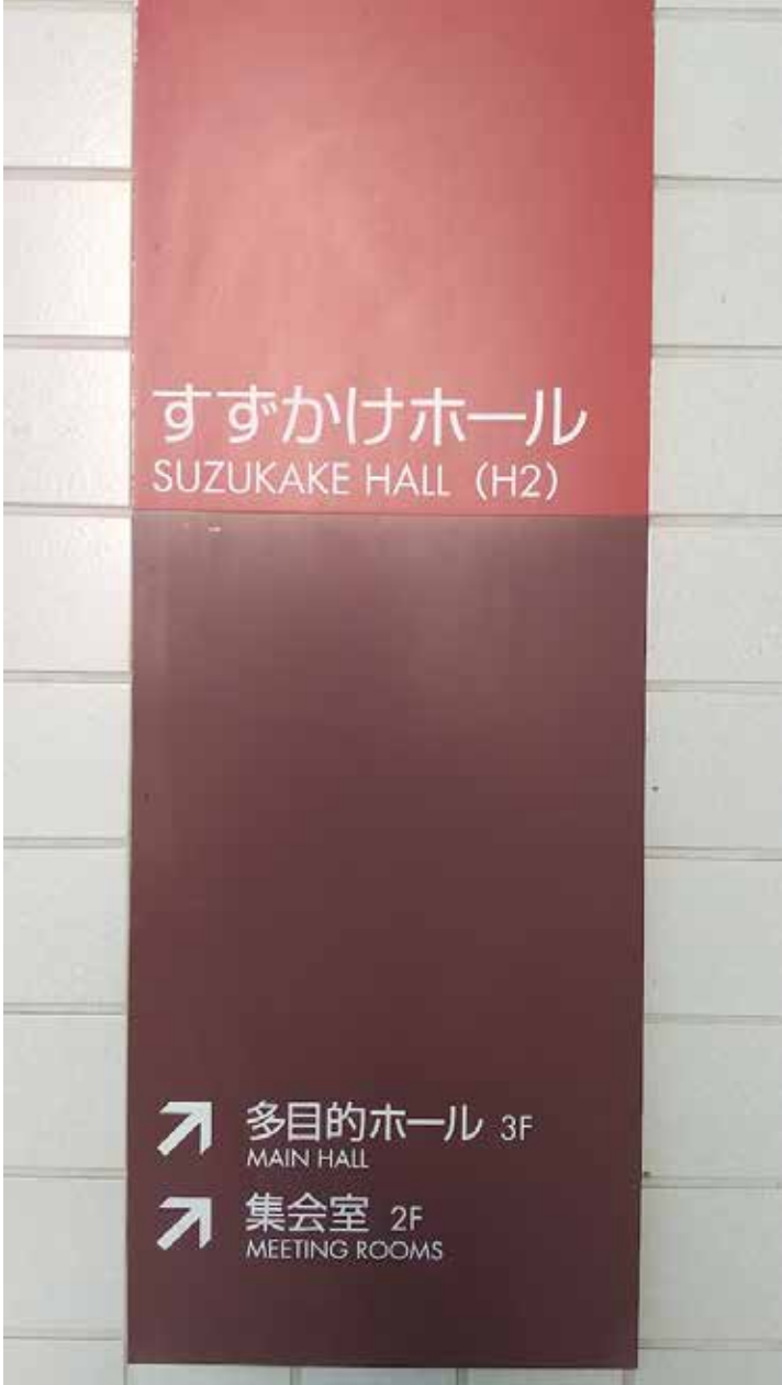
The registration desk is located on the 3 rd floor.